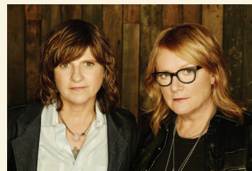
THE INDIGO GIRLS