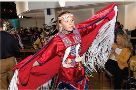
REDHAWK INDIGENOUS ART COUNCIL